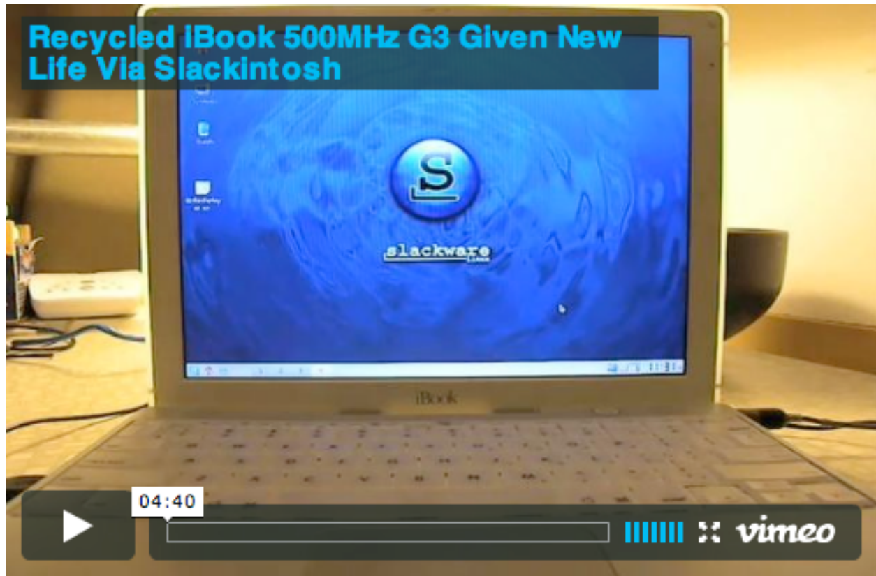
Recycled iBook 500MHz G3 Given New Life via Slackintosh— recycled iBook, slackintosh open source operating system (ecoarttech, 2010)