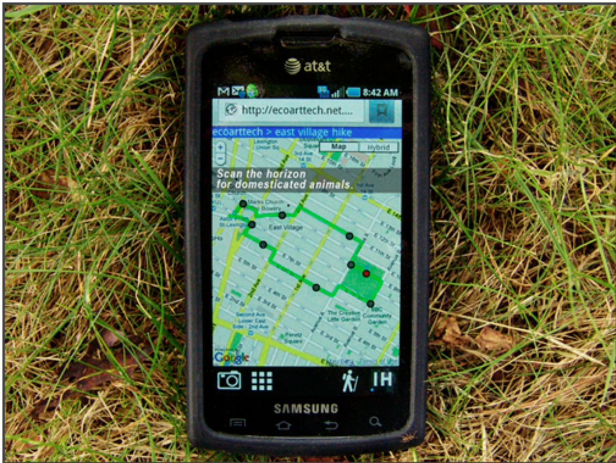
Indeterminate Hikes—Custom Android app for urban hiking (ecoarttech, 2010)

Eco-art can hold onto what is lost in mobile non-location; it can entail staying put. Or eco-art can create a “habitable” space within dizzyingly new experiences, a space hospitable to human-animal creativity. Or perhaps, always, eco-art performs both at the same time. Eco-art is dis-placed continuity and continuous dis-location. It is responsive resistance and resistant response. It is homelessness, or restlessness, at home with itself. It is neither truly nostalgic, nor inherently progressive. When Arthur and Marilouise Kroker define “critical digital studies,” they articulate this sentiment without reference to homemaking or eco-art: “There is a desperate requirement to do something that is as ancient as it is futurist: to find the ‘words’ by which to make familiar to our senses the new home of digital technologies within which we have staked our identities” (Kroker & Kroker, 2008, pp. 7-8).