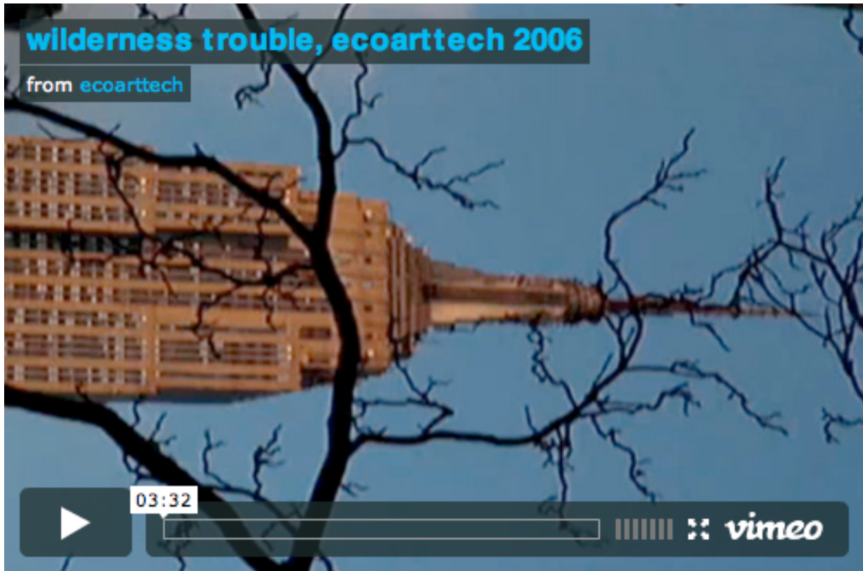
Wilderness Trouble—digital video (ecoarttech, 2006)

Ice, sticks, rocks: these need not be the media of eco-art. The Greek etymological origins of “eco-art” are oikos (house or dwelling) + art (to fit together). To fit together a home—and where else do we make our homes but in cities, suburbs, countrysides, on highways and subway trains, online and networked amidst wireless connections and seemingly isolated on hikes in national parks? For philosopher Félix Guattari, the term “eco-art” recalled the effort to make social, environmental, and psychological ecosystems “habitable by a human project,” to make ourselves and others (rather than capital) at home in the world. “Ecology must stop being associated with the image of a small nature-loving minority,” he wrote. “It is not only species that are becoming extinct but also words, phrases, and gestures” (Guattari, 2000, p. 35 & p. 29).